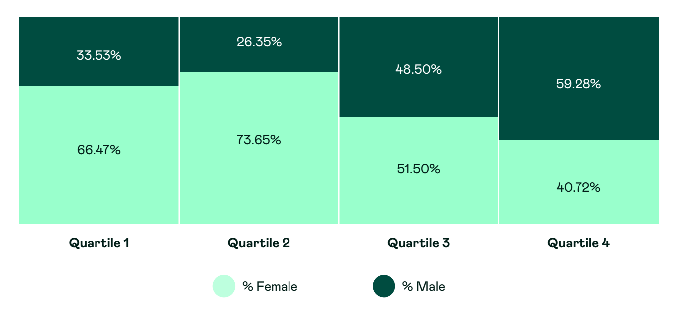
Figure 2: 2018 Gender representation across four quartiles of pay