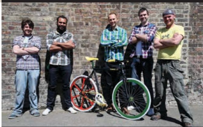
ISA NACEWA'S RASTA BIKE: RUGBY LEGEND ISA (SECOND FROM LEFT) PICTURED WITH THE FUNKED UP FIXIES TEAM.