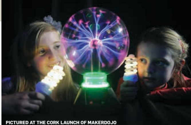
PICTURED AT THE CORK LAUNCH OF MAKERDOJO

"Italy was a natural next step in our European expansion plans and builds off of our recent entries into the Netherlands and France," said Jim Travers, Chairman and CEO of Fleetmatics. "The acquisition of Visirun enables us to scale our European subscriber base while also bringing us important Italian market expertise." Visirun will add approximately 28,000 vehicles under subscription to Fleetmatics' existing installed base and add an additional 3,000 customers.